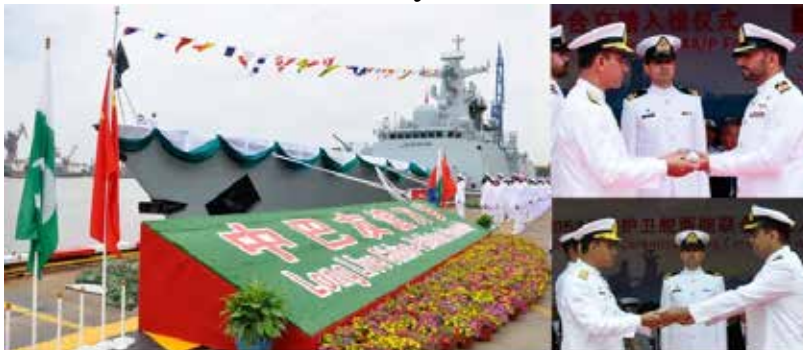
Chief of the Naval Staff Admiral Muhammad Amjad Khan Niazi during commissioning ceremony of two newly built Type 054 A/P Frigates (PNS TIPPU SULTAN & PNS SHAHJAHAN) handing over the traditional command scrolls to the Commanding Officers at Hudong Zhonghua Shipyards Shanghai, China

ISLAMABAD (Agencies): In an impressive ceremony held at Hudong Zhonghua Shipyards Shanghai, China; two newly built Type 054 A/P Frigates namely PNS TIPPU SULTAN and PNS SHAHJAHAN were commissioned in Pakistan Navy. Chief of the Naval Staff Admiral Muhammad Amjad Khan Niazi graced the ceremony as Chief Guest and handed over the traditional Command Scrolls to the Commanding Officers of PN Ships. Speaking on the occasion, the Chief of the Naval Staff highlighted that the commissioning of PNS TIPPU SULTAN and PNS SHAHJAHAN ushers a new chapter in Pak - China friendship that has matured and rests firmly on the pillars of trust, respect, and mutual support. The same is manifested in our defence collabora-